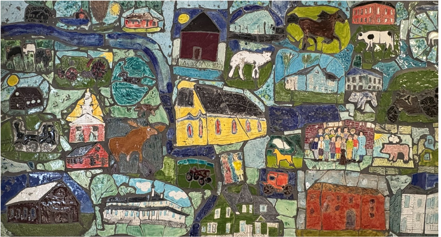
Mural in the Putney Central School