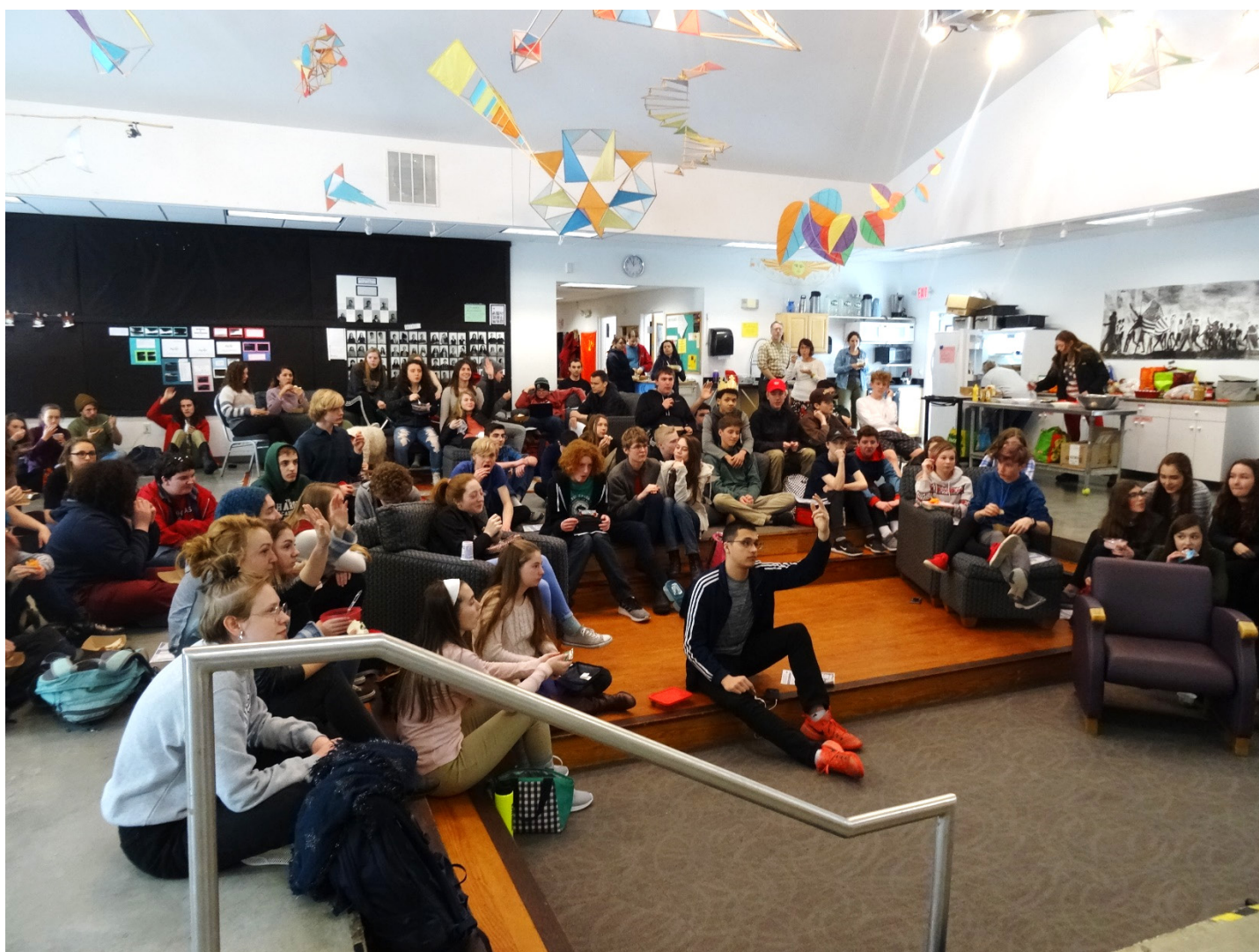
Sharon Academy High School students shared their ideas for the future.