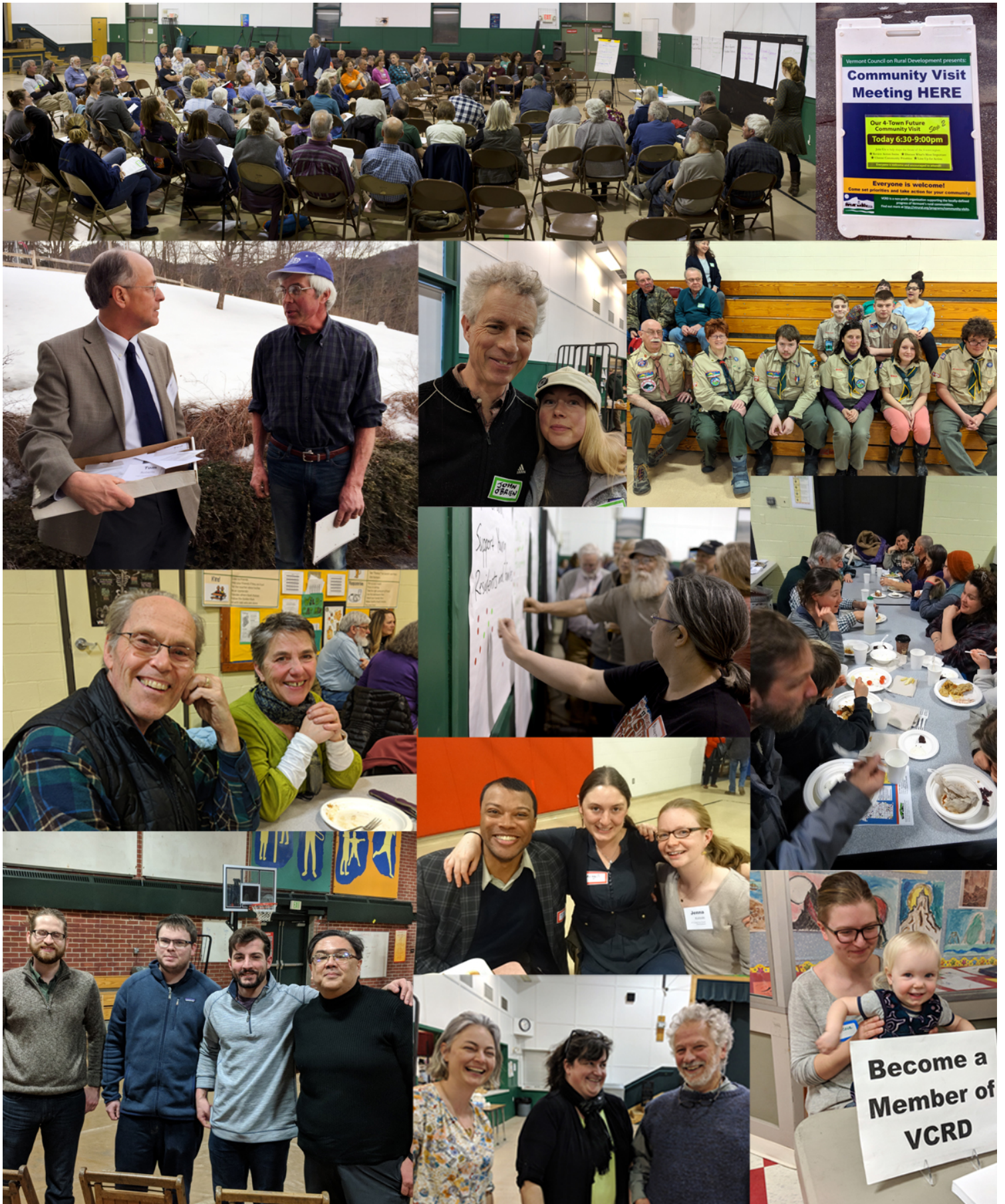
Scenes from the "Our 4-Town Future" Community Visit process.