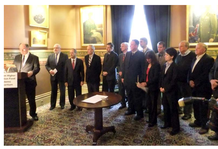
Members of the Higher Education Food Systems Consortium

Today, members of the VHEFSC are designing new ways to collaborate, share students and resources and expand elective opportunities for place-based food systems education where "Vermont is our classroom." We are advancing an ambitious action plan to make Vermont the epicenter of the food systems movement in higher education in this country. Members will work together to attract students and future working lands entrepreneurs to Vermont. Find out more at <a href="http://vtrural.org/programs/facilitation/food-systems">http://vtrural.org/programs/facilitation/food-systems</a>.