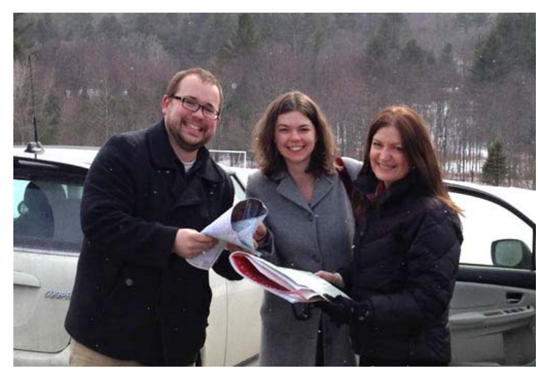
VCRD's Vermont Digital Economy Project staff

Expanding the use of online resources has benefits far beyond emergency management. Downtown businesses, service providers, farmers, and the tourism industry are all finding opportunities to reach new audiences and markets. At the same time, the social fabric of our communities is getting stronger as a result, as neighbors share local online conversations. Through this project businesses are improving their bottom line, while government and nonprofit organizations are developing ways to deliver services more effectively. Find out more at <a href="https://www.wtg.edu.org">wtg.edu.org</a>.