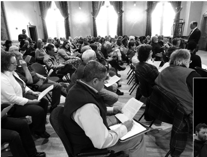
Community members read the list of opportunities aloud on Community Meeting Day , April 18 th .

The basin and riverside are unparalleled but underutilized assets for the future of Vergennes. A Basin and Riverside Task Force could galvanize community volunteers for immediate work to improve the area and to plan longer term strategic improvements. Residents envision a small mooring field for visiting boaters, a modest expansion of the docks, improved trails, expanded seating and picnic tables, landscaping, beautification, extended WiFi, improved lighting on the east side, and better signage. Some see future steps including building a boat house with rest rooms, or even a pavilion on the west shore, and improving a gravel path or a board walk on the east side. Work should be completed to connect the rail trail to the park. With heritage trail signage and public artwork this area could be an enormous benefit to local folks and draw to tourists. Some envision a day when events, bands, food, and a new pedestrian bridge could make the basin a major attraction for the entire region.