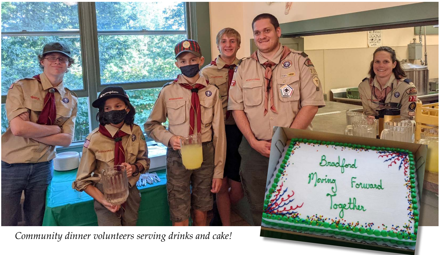
Community dinner volunteers serving drinks and cake!