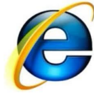
MS Internet Explorer