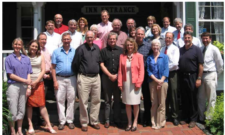
VCRD Staff and Board